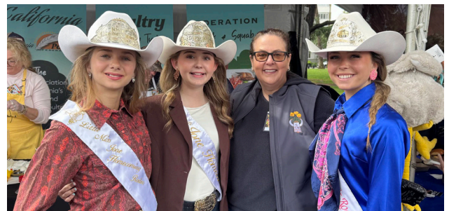
2026 Lone Homecoming Rodeo Little Miss, 2026 Lone Homecoming Rodeo Jr. Queen & 2025 Amador County Fair Rodeo Queen